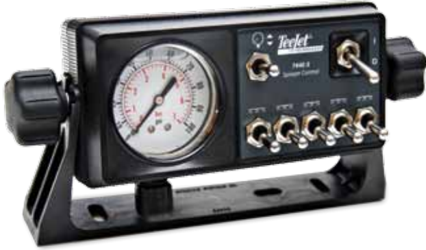
744E SPRAYER CONTROLLER