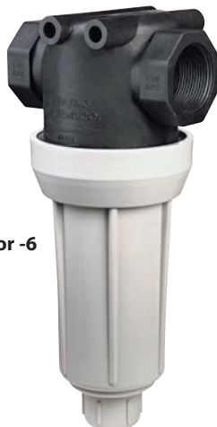
AA126ML-5 or -6