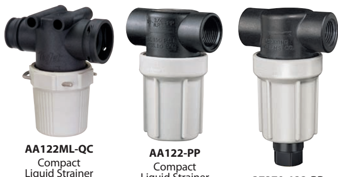
AA122ML-QC Compact Liquid Strainer